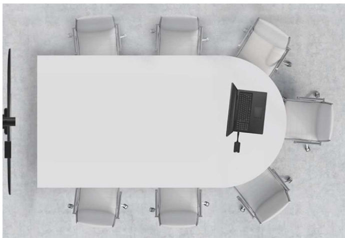
Innex Connect Pro+

Unlike traditional setups with complex and messy cabling, the Innex Connect Pro+ simplifies meetings with a single USB connection, eliminating cable clutter.