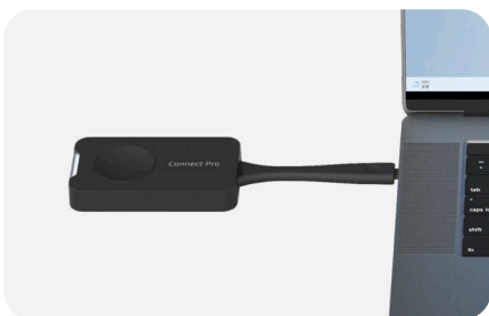
Connect Pro Button