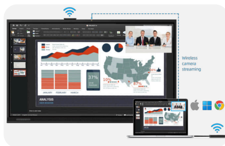
Airplay / Miracast/ Chromecast